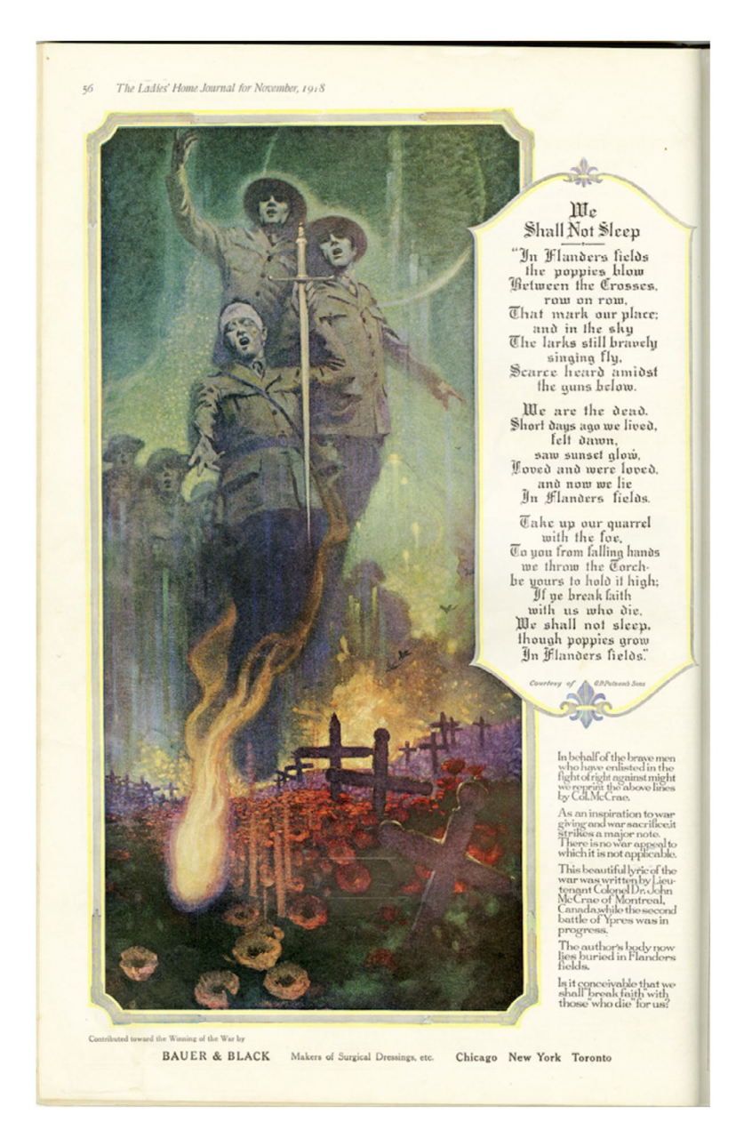
Figure 3. John McCrae. 'We Shall Not Sleep.' The Ladies' Home Journal 35, No. 11 (November 1918): 56. Modern Literature and Culture Research Centre, Ryerson University, Toronto.

fields, while the accompanying full-page colour illustration supplied the amplifying visual rhetoric. Out of the horizontal battlefield covered with poppies arises the flame as a vertical projection of triumph, carrying a chorus of soldiers chanting as they move upward to heaven. The rhetorical question at the end asks: 'Is it conceivable that we shall "break faith" with those "who die" for us?<sup>57</sup> This poem and advertisement were encountered by a woman who would become a leading figure in the popularization of McCrae's poppy imagery for the First World War commemoration: Moina Belle Michael (1869-1944), a professor at